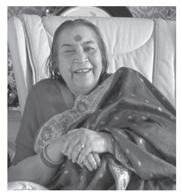
earth, as if a torrential rain or a waterfall with such tremendous force as if I was unaware and got stupefied.

It is the greatest event of all the spiritual happenings of the universe... Without this happening, there could not have been the possibility of giving en-mass realization to people. As soon as the Sahasrara was opened, the whole atmosphere was filled with tremendous chaitanya, and there was tremendous light in the sky, and the whole thing came on this