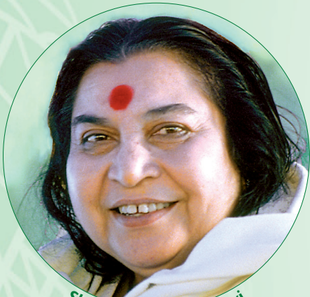
Shri Mataji Nirmala Devi