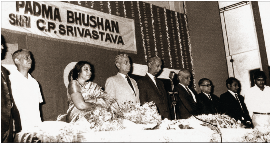
Padma Bhushan, awarded by the President of India, 1972.